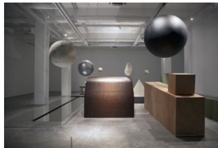
3 Liu Wei, Period , 2018.