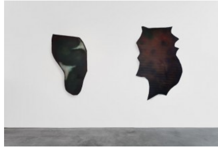
1 View of Liu Wei's "Shadows" at Long March Space, Beijing, 2018. Left: Cave No. 1 , 2018. Right: Cave No. 2 , 2018.

Beginning in November last year—allegedly as a preventative measure in response to a fire in an apartment building in a south-Beijing suburb earlier that month that killed 19 workers—the city's central government evicted tens of thousands of migrants in a weeks-long campaign to demolish unauthorized homes. The targeted areas included warehouses, rental compounds, wholesale markets, and other makeshift establishments along the rural-urban fringes of the city—an unofficial effort to purge Beijing of its so-called "low-end population." Expulsion, sociologist Saskia Sassen explains, is not a localized process. (2) To view the mass movement of people against their will within the limited narrative afforded by terms such as "migrant worker" or "refugee" is to miss the holistic point that the flow of human bodies is inextricably linked to wider structures affecting change on a planetary scale, which determine and reify the unequal distribution of resources. Liu's work can be seen as an attempt to momentarily grasp such abstractions. In "Shadows," nothingness draws objects, people, places, and non-places into a makeshift constellation where everything coalesces onto a plane of equivalence, ushering in new beginnings. Responding to local conditions that are often severely simplified in both media and rhetoric, Liu traces a cartography that extends beyond the visible and material, gesturing toward an ominous totality.