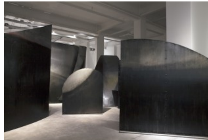
2 Liu Wei, Shadows , 2018.